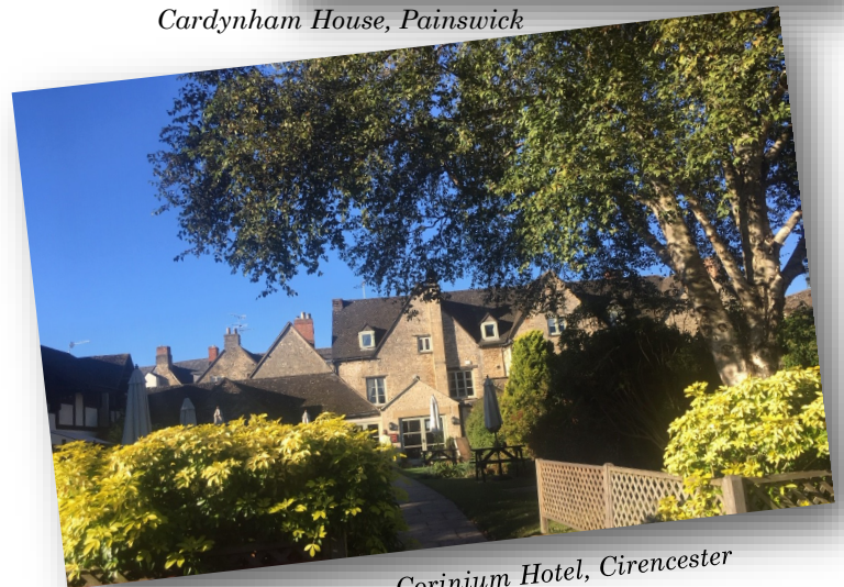
Corinium Hotel, Cirencester