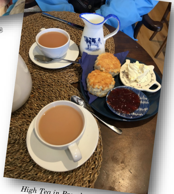
High Tea in Broadway