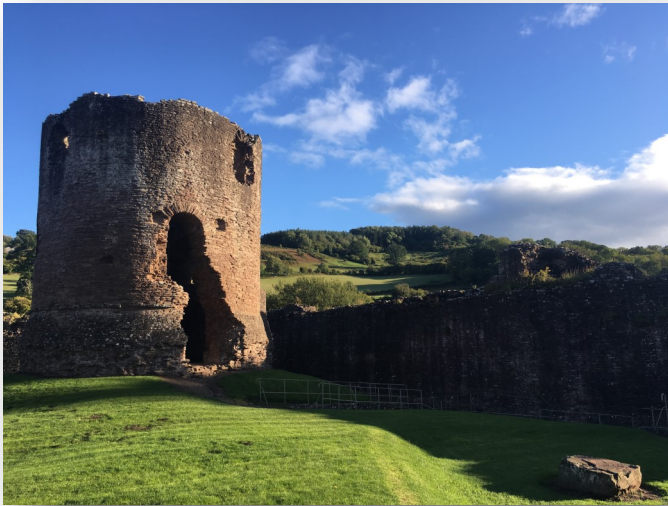
Skenfrith Castle, Wales