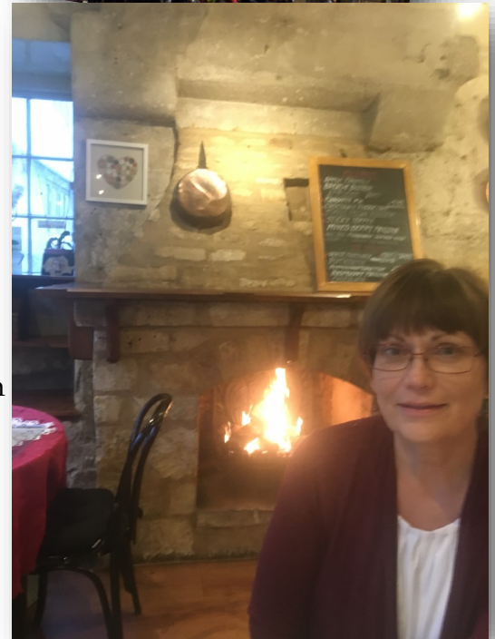
Cardynham House, Painswick