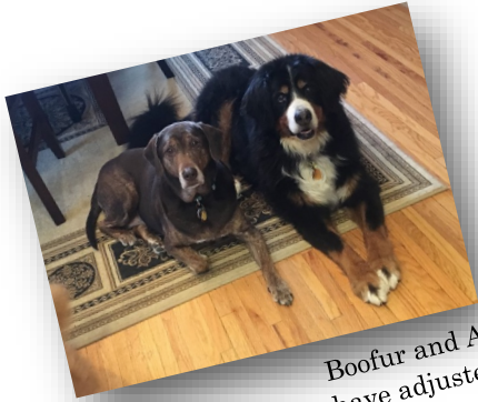
Boofur and Abby are still our furry kids. They have adjusted to their new home in Michigan.